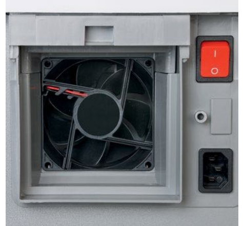
Powerful fan sucks in fine dust particles inside the document shredder and feeds them to the filter