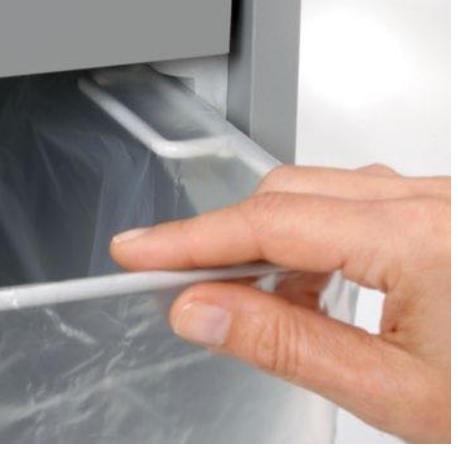
Pull-out rounded top frame that's kind on the fingers when changing the waste bag