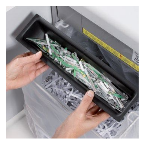
Separate, integrated waste boxes help to sort shredded paper, CDs, DVDs, cheque and credit cards for eco-friendly recycling