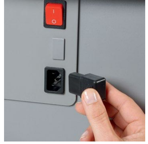
Detachable IEC power plug makes the document shredder quick and easy to move from A to B