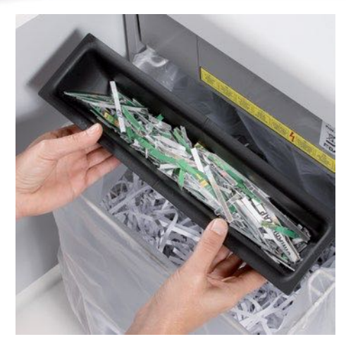
Separate, integrated waste boxes help to sort shredded paper, CDs, DVDs, cheque and credit cards for eco-friendly recycling