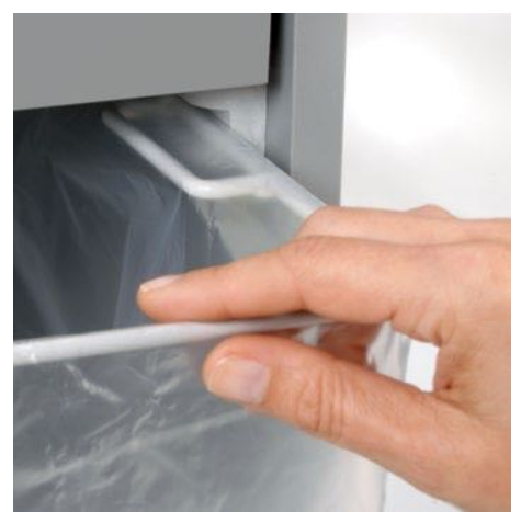
Pull-out rounded top frame that's kind on the fingers when changing the waste bag