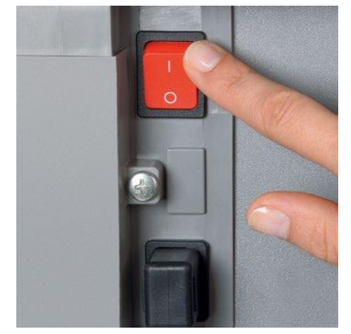
Separate main switch is located on the rear of the document shredder and completely disconnects it from the mains power supply