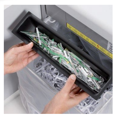
Separate, integrated waste boxes help to sort shredded paper, CDs, DVDs, cheque and credit cards for eco-friendly recycling