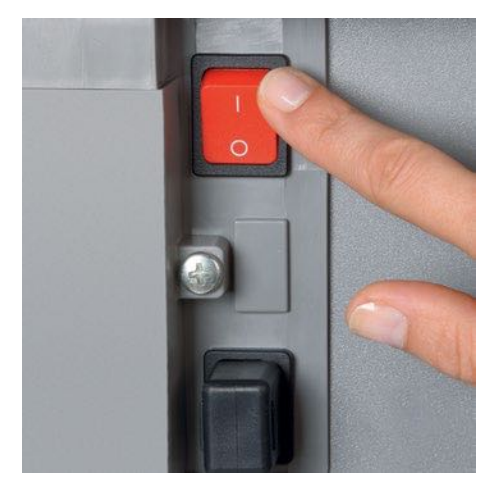
Separate main switch is located on the rear of the document shredder and completely disconnects it from the mains power supply