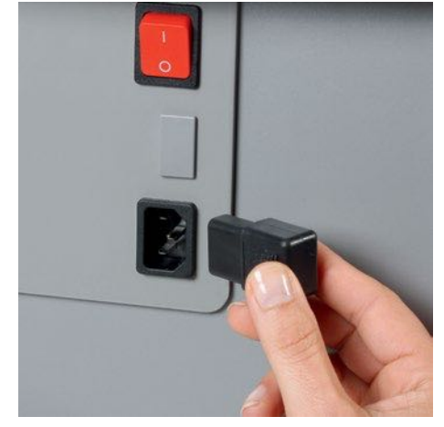
Detachable IEC power plug makes the document shredder quick and easy to move from A to B