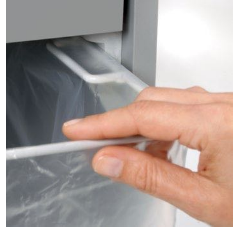
Pull-out rounded top frame that's kind on the fingers when changing the waste bag