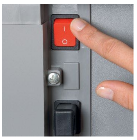
Separate main switch is located on the rear of the document shredder and completely disconnects it from the mains power supply