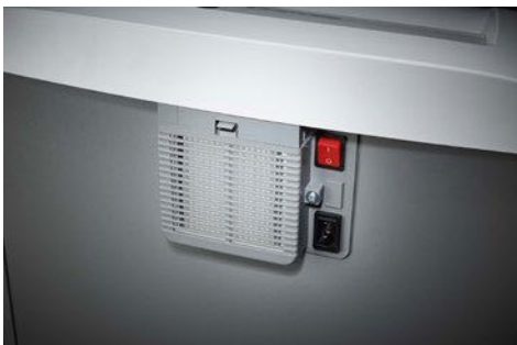
Dahle Waste 204air document shredder