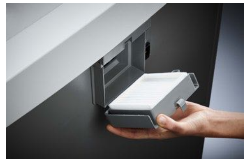
Dahle Waste 204air document shredder