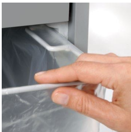
Pull-out rounded top frame that's kind on the fingers when changing the waste bag