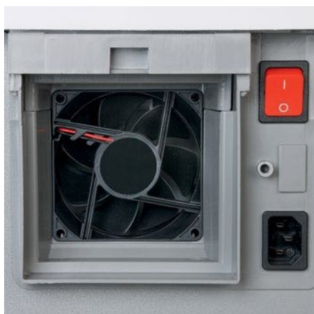
Powerful fan sucks in fine dust particles inside the document shredder and feeds them to the filter