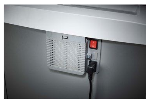
Dahle Waste 204air document shredder