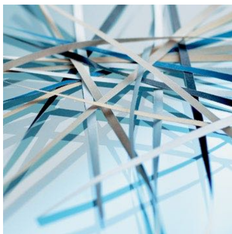
P-2 security: recommended, for example, for data media containing internal data that are to be made illegible