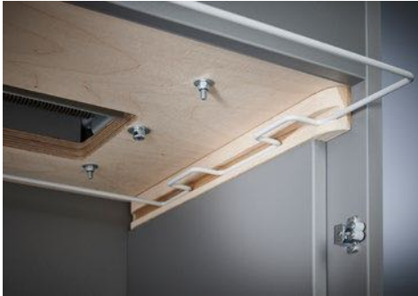
Dahle Waste 204air document shredder