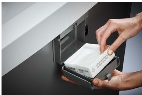
Dahle Waste 204air document shredder