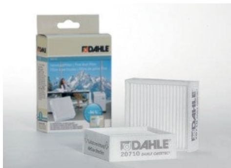
Fine particle filters Dahle 20710