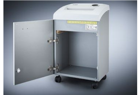
Dahle Waste 204air document shredder