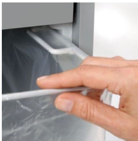
Pull-out rounded top frame that's kind on the fingers when changing the waste bag