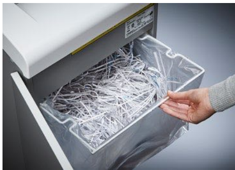
Dahle Waste 204 document shredder