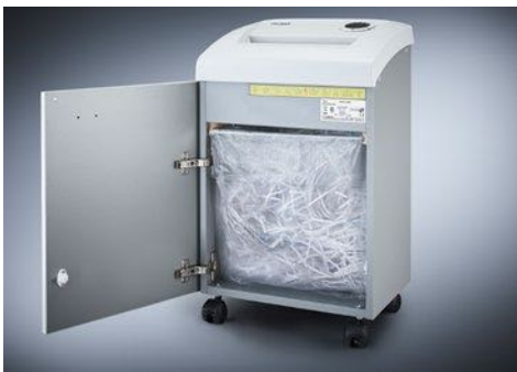
Dahle Waste 204 document shredder