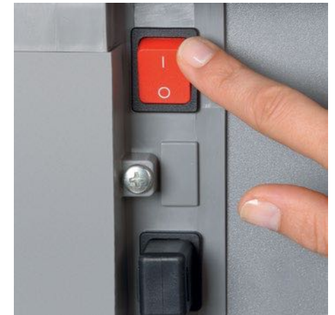
Separate main switch is located on the rear of the document shredder and completely disconnects it from the mains power supply