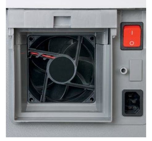
the document shredder and feeds them to the