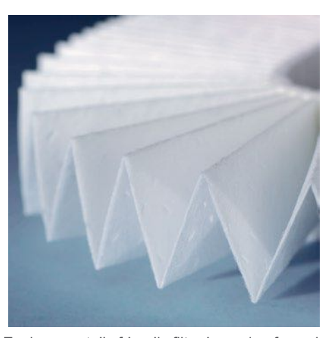
Environmentally friendly filter is made of speci- Powerful fan sucks in fine dust particles inside al 3-ply, fully recyclable non-woven material