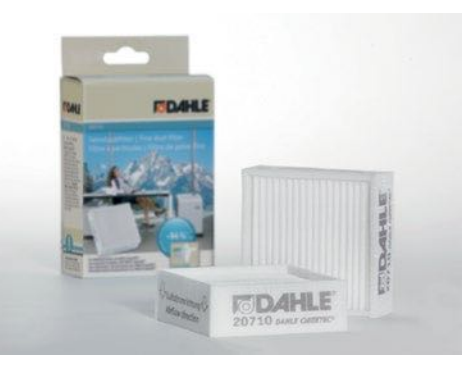
Fine particle filters Dahle 20710