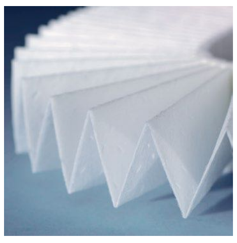
Environmentally friendly filter is made of speci- Powerful fan sucks in fine dust particles inside al 3-ply, fully recyclable non-woven material