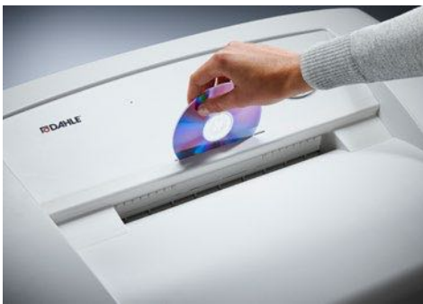
Dahle Waste 214 document shredder