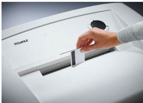
Dahle Waste 214 document shredder