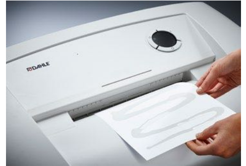
Dahle Waste 214 document shredder