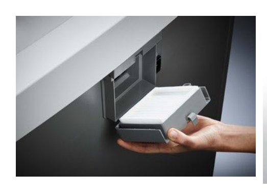
Dahle Waste 216air document shredder