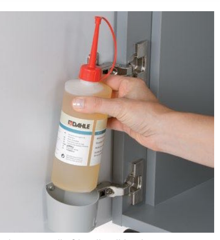
Environmentally friendly oil is always easy to access, included with all cross-cut models