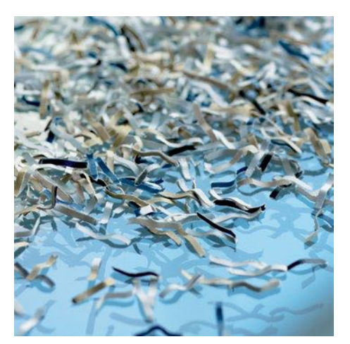
P-5 security: recommended, for example, for data media containing secret data