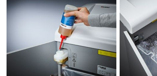
Dahle Security 506air document shredder