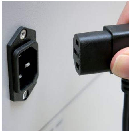
Detachable IEC power plug makes the document shredder quick and easy to move from A to B