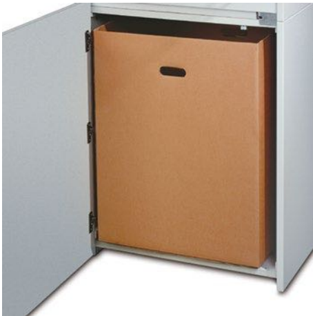
Sturdy waste boxes for permanent use with models 20390 to 20397