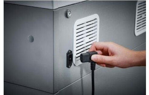
Dahle Security 519 document shredder