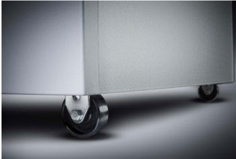
Dahle Security 519 document shredder