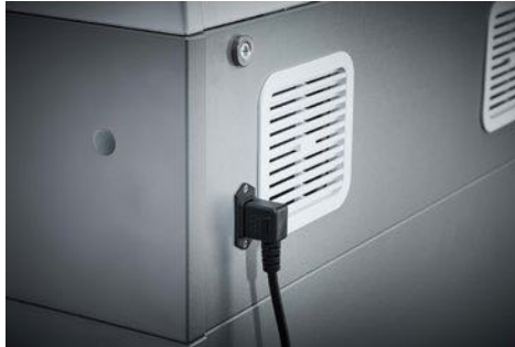
Dahle Security 519 document shredder