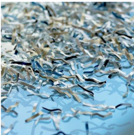
P-5 security: recommended, for example, for data media containing secret data