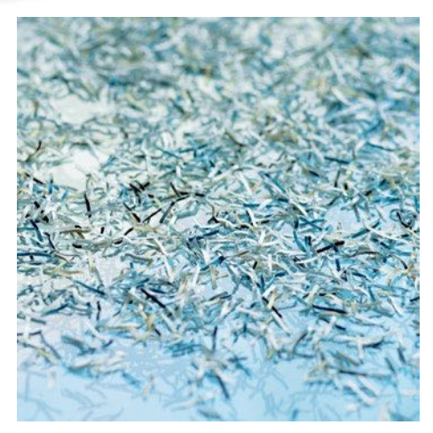
P-6 security: recommended for data media containing secret data demanding exceptionally stringent security measures