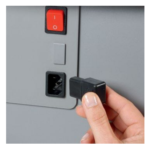
Detachable IEC power plug makes the document shredder quick and easy to move from A to B

Separate main switch is located on the rear of the document shredder and completely disconnects it from the mains power supply