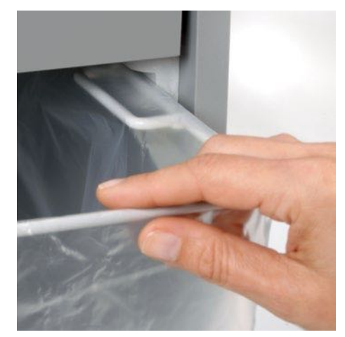
Pull-out rounded top frame that's kind on the fingers when changing the waste bag