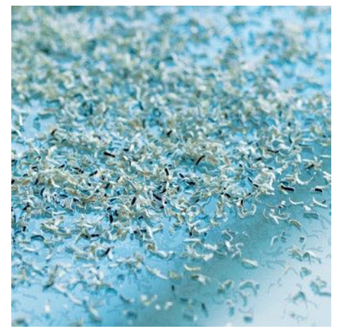
P-7 security: recommended for data media containing top secret data demanding maximum security measures