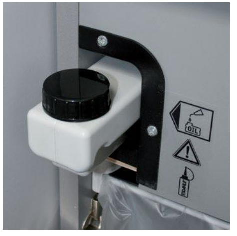
Integrated oil tank for controlled, automatic lubrication of the cross-cut cutters helps to lengthen service life while keeping performance constant