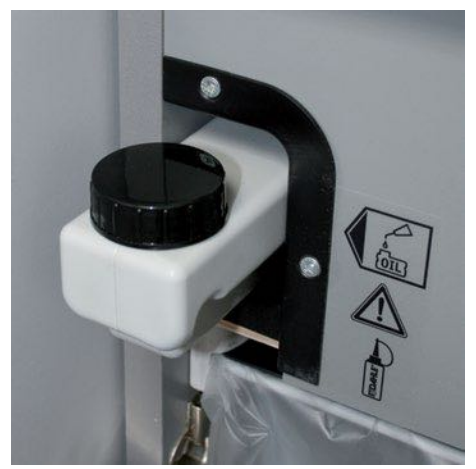
Integrated oil tank for controlled, automatic lubrication of the cross-cut cutters helps to lengthen service life while keeping performance constant