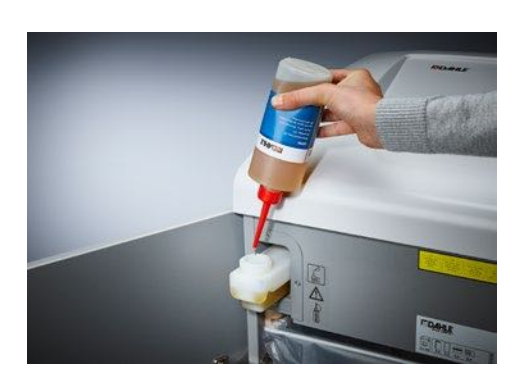
Dahle Top Secret 714 document shredder