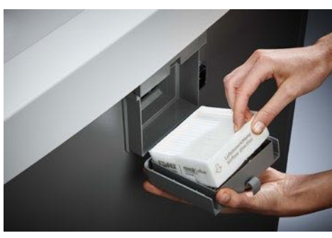
Dahle Top Secret 716air document shredder