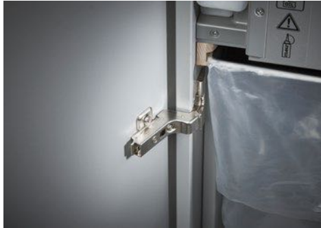
Dahle Top Secret 716air document shredder