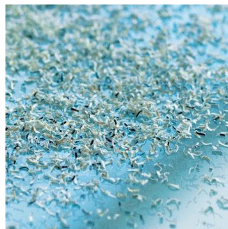
P-7 security: recommended for data media containing top secret data demanding maximum security measures