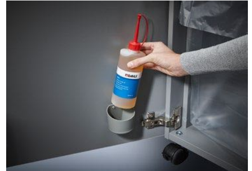
Dahle Top Secret 716air document shredder