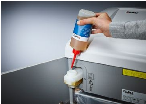
Dahle Top Secret 716air document shredder