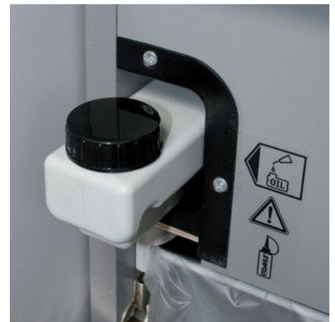
Integrated oil tank for controlled, automatic lubrication of the cross-cut cutters helps to lengthen service life while keeping performance constant