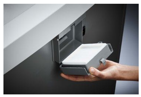
Dahle Top Secret 716air document shredder