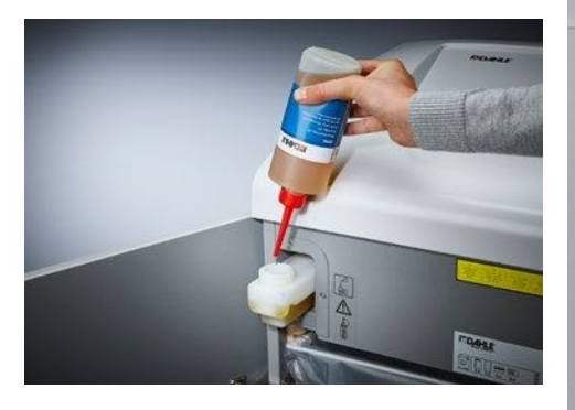
Dahle Top Secret 716 document shredder