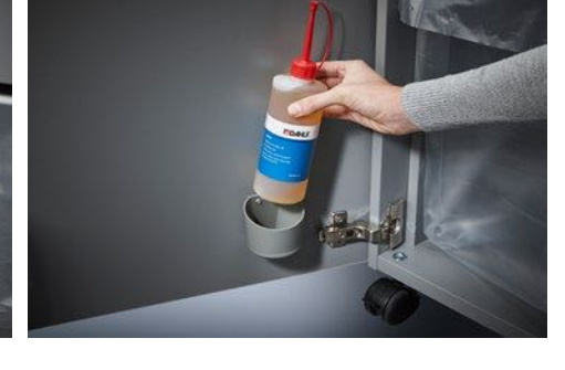
Dahle Top Secret 716 document shredder