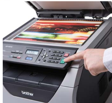
Colour scan your A4 documents.

This fast, compact high-performance printer, copier and colour scanner offers automatic duplex printing and an optional high yield toner to reduce running costs.