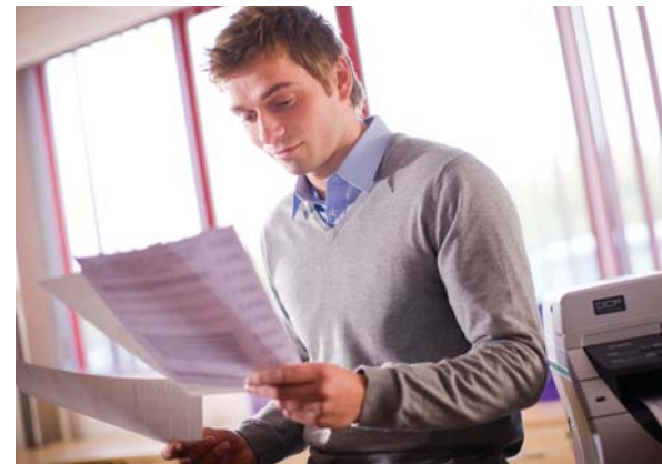
Create an instant impact - with quick 28ppm A4 printing.