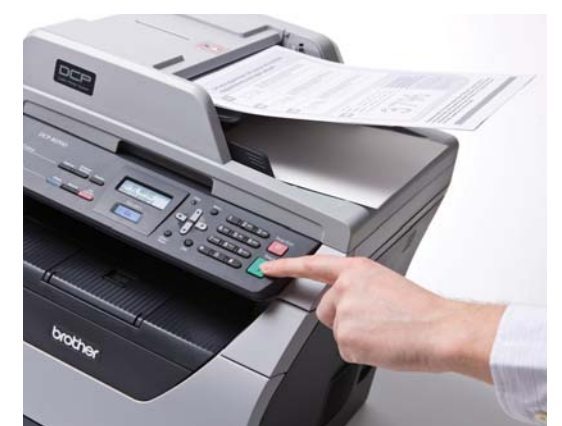
Automatic Document Feeder - ideal when copying or scanning multiple page documents.