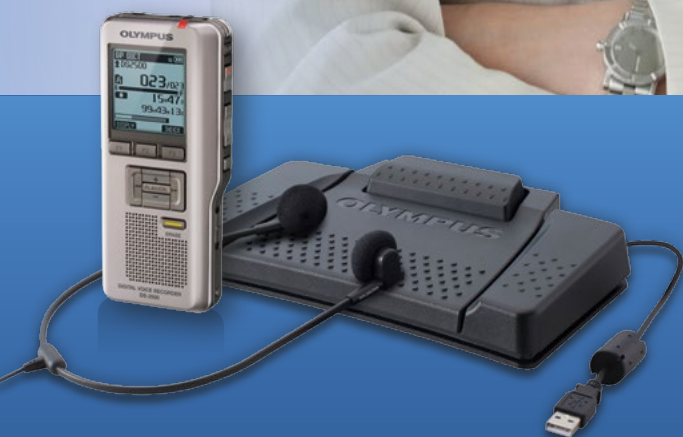
Digital Dictation and Transcription Kit Silver Pro

All you need from dictation to transcription