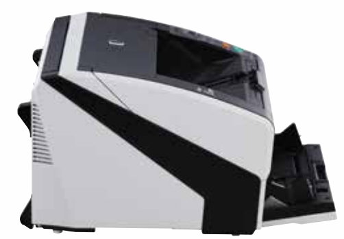
fi-7800 – A4 Landscape at 300 dpi 110 ppm / 220 ipm fi-7900 – A4 Landscape at 300 dpi 140 ppm / 280 ipm Scan mixed batches through the 500 sheet ADF