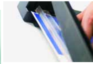
The high-quality, ground blade guarantees a clean, sharp cut, even with frequent use.