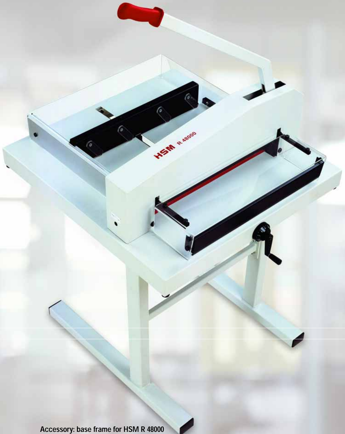
Accessory: base frame for HSM R 48000