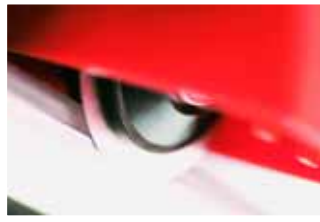
The cutting blades are covered completely to ensure user safety.