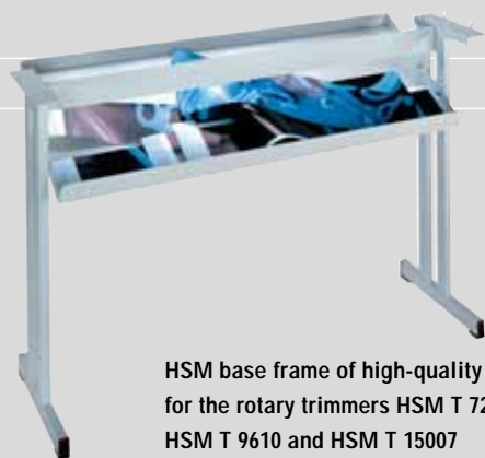
HSM base frame of high-quality metal for the rotary trimmers HSM T 7220, HSM T 9610 and HSM T 15007 (Dimensions: L 940/1230/1680 x W 420 x H 800 mm)