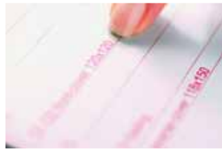
Scaling in cm/inches and DIN formats.