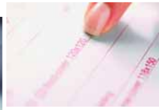
Scales accurate to the millimetre guarantee absolute precision work.