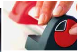
A quick turn of the lock enables the cutting head to be replaced with ease.