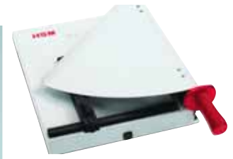
HSM cutting machines from the CA and CS series with practical, laterally folding guard plate.