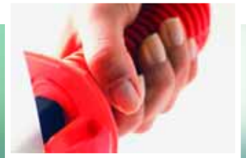
Ergonomically shaped handle.