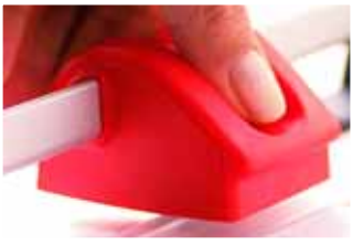
Ergonomic cutting head for perfect handling.