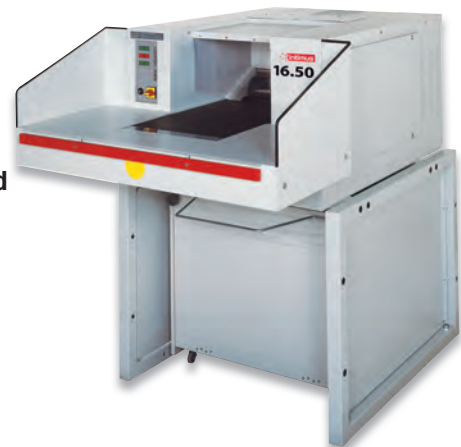
W/D/H 120 x 195 x 155 cm

For decades, the intimus® heavy duty shredders have proven to be centrally positioned pieces of equipment for the privacy-friendly disposal of disused media. The model range offers variations that can handle up to 550 sheets/h or even complete folders in a single operation. The spacious feed table with integrated infeed conveyor belt provides controlled, effortless, safe and fast loading. The shredded material is collected in large-scale, mobile or swing-out containers under the cutting mechanism. The shredder combinations are coupled to a baler for immediate fully automatic compaction of the cut material into compact bales. Reduction effect compared to the loose collection of the cuttings is about 70%.