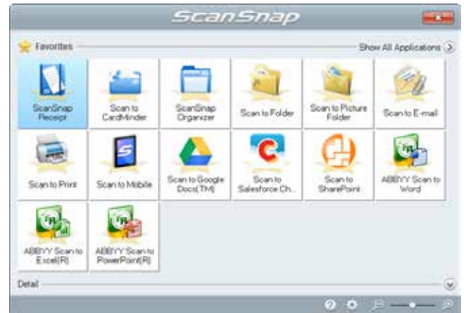
*Quick Menu for Mac OS features other applications