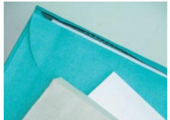
Opening process, no scrap, chadless.

Automatic feeding via transfer belt and automatic on/off control via light barrier.