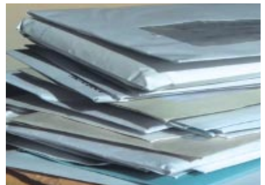
Strong envelopes and high stacks of envelopes can be accepted without pre-sorting.