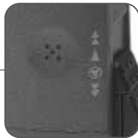
Turbo Wind gives you fast access to any part of the tape