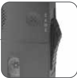
4-Position Switch lets you operate all of the functions with one hand