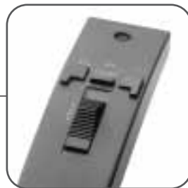
4-Position Switch for single-handed operation