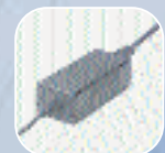
Power Supply 155