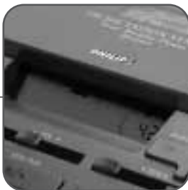
Visual Workflow Display allows you to see cassette length and recorded time at-a-glance