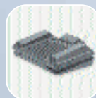
Foot Control 210

Included in the Analogue Transcription/Dictation Kit 730: