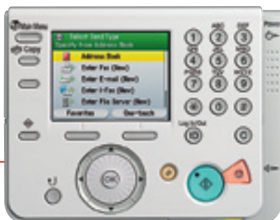
The large 3.5 inch colour TFT display with Easy-Scroll Wheel allows everyone effortless access to all functions.

Documents can be scanned into a number of digital formats including convenient 'Compact PDF' using Canon's unique high compression technology. This provides high quality, portable PDF documents that are perfect for sharing via SEND functionality.