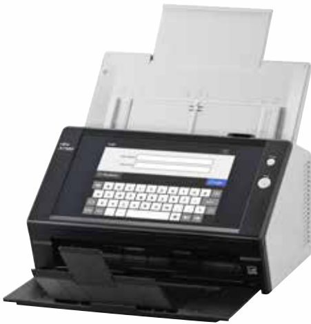
A4 Portrait at 300 dpi 25 ppm / 50 ipm Scan mixed batches up to 50 sheets