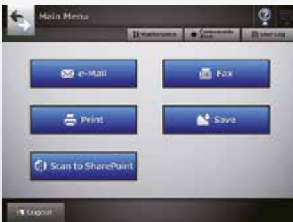
Main Menu screen

The N7100 satisfies the digitising needs in larger scale networks as well as in environments where more basic file servers and e-mail servers are deployed. It is right at home with more complex LDAP/LDAPS authentication-based networks, and allows for integration with Microsoft Exchange Servers, FTP servers, third party applications and portal and collaboration platforms.