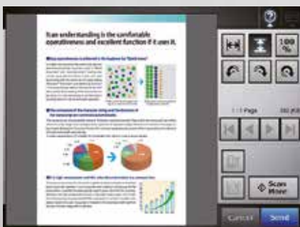
Preview screen (Scan viewer)

An SDK is available for the N7100 to further meet the needs of your business. This SDK will enable developing a connector to a preferred third-party application, may that be a DMS, ECM, BPM or ERP system. This connector in turn is uploaded to the N7100 and then acts as a one button door opener into the productive target systems. The SDK additionally provides for utilising IC readers attached to the network scanner's USB port.