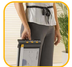
Carry handle for easy portability