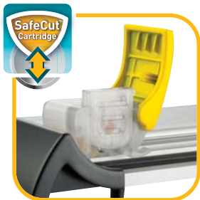
SafeCut™ blade carries quick & easy blade exchange