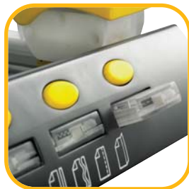
SafeCut™ blade storage