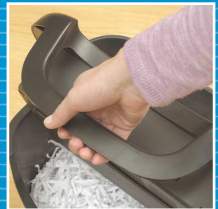
Easy empty bin.