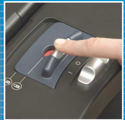
Safety lock mechanism prevents accidental activation.