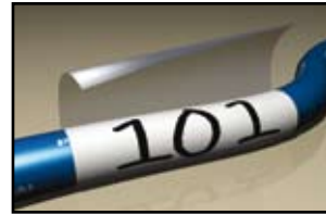
Wire and Cable Marking