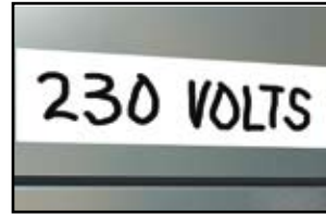
General Purpose Marking