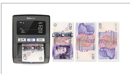
Insert British Pound banknotes in any direction