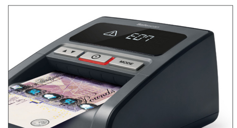
Suspected banknote alarm with visual and audio alert