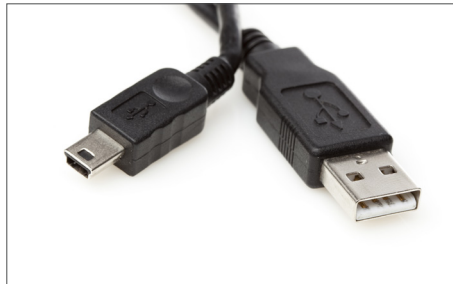
Safescan USB update cable Art. no: 112-0459