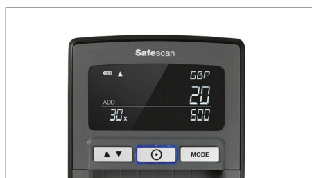
Shows quantity and totals