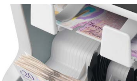
Identifies banknotes that are unfit for ATM machines and recirculation