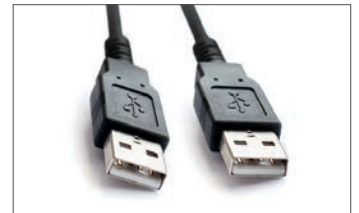
Safescan USB Cable Art. no: 124-0458