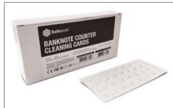
Safescan Cleaning Cards Art. no: 152-0663