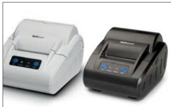
Safescan TP-230 Thermal Printer Art. no: 134-0475 Grey Art. no: 134-0535 Black