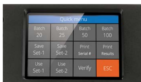
High definition touch display with multi-lingual interface and quick menu