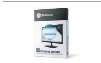
Safescan MCS Software Art. no: 124-0500