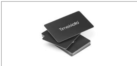
TimeMoto RF-100 set of 25 RFID badges Art. no: 125-0603