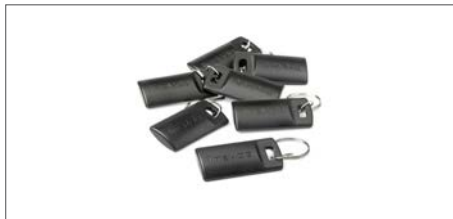
TimeMoto RF-110 set of 25 RFID key fobs Art.no: 125-0604