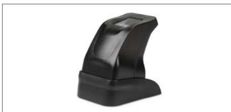
TimeMoto FP-150 USB Fingerprint Reader Art.no: 125-0606