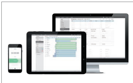
TimeMoto Cloud / TimeMoto Cloud Plus Art.no: 139-0590 / 139-0591