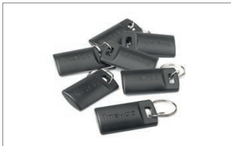
TimeMoto RF-110 set of 25 RFID key fobs Art.no: 125-0604