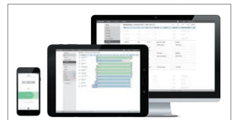
Or TimeMoto Cloud (30 days included)