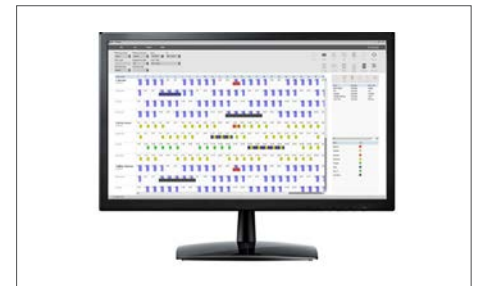
TimeMoto PC Software Plus Art.no: 139-0600