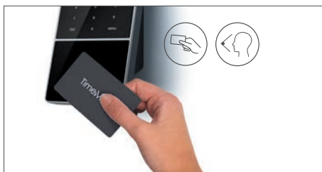
Clocking with RFID proximity card, Face recognition or PIN code