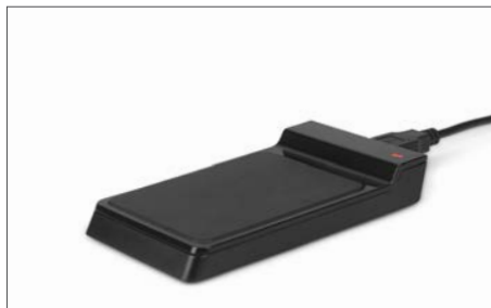
TimeMoto RF-150 USB RFID Reader Art. no: 125-0605