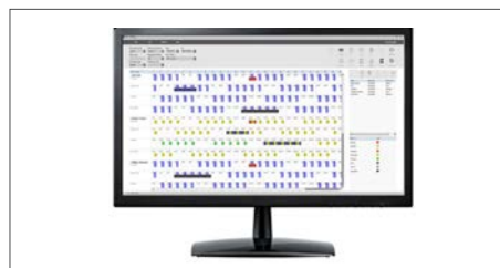
TimeMoto desktop software for single PC use included