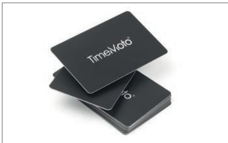
TimeMoto RF-100 set of 25 RFID badges Art. no: 125-0603