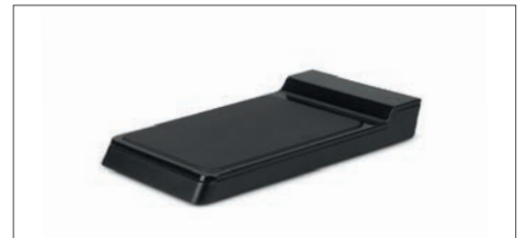
TimeMoto RF-150 USB RFID Reader Art. no: 125-0605