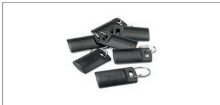
TimeMoto RF-110 set of 25 RFID key fobs Art.no: 125-0604