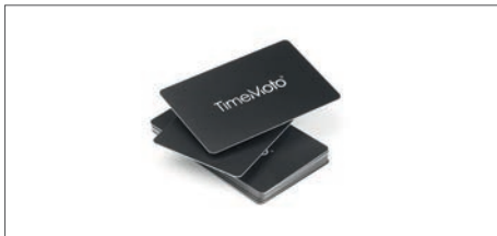
TimeMoto RF-100 set of 25 RFID badges Art. no: 125-0603