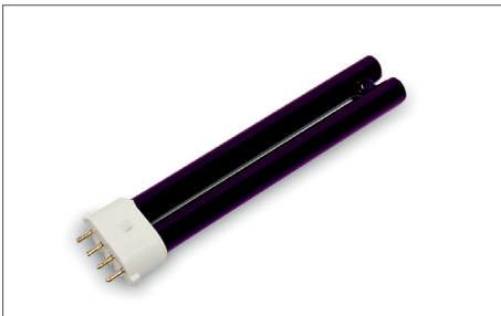
Safescan 50 / 70 UV tube