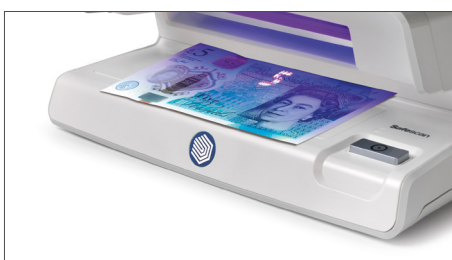
Ready for the new polymer banknotes