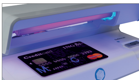
Verifies UV features of creditcards