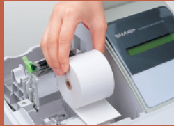
Drop-in paper loading

Featuring thermal printing technology, the XE-A213/A203 print out sales receipts at a speedy rate of about 12 lines a second. Plus, a newly developed Drop-in Paper Loading mechanism allows you to exchange paper rolls quickly and easily.